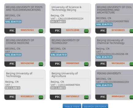
194 search results for Beijing university

As mentioned above, a further complementary survey specifically on recognition will be sent to the student after the mobility period to assess the quality of the recognition provided.