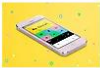
Game-based Learning [Gamification]