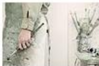
Case-Based Learning CBL