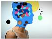
Problem-based learning PBL