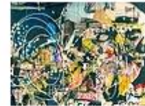
Value and Knowledge Education VaKE