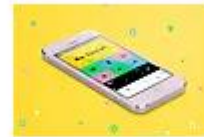
Game-based Learning [Gamification]