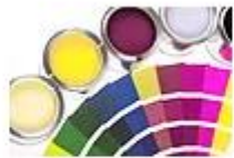
Project-based learning PjBL