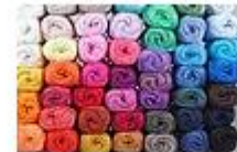
Evidence-based practice EBP