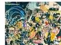
Value and Knowledge Education VaKE