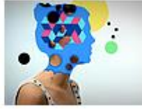
Problem-based learning PBL