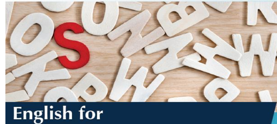
English for internationalization purposes