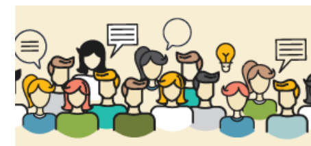
The Erasmus+ Israeli HEREs