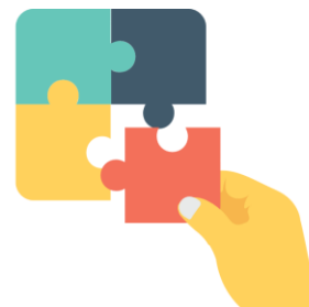
Cooperation Projects (HE&VET)